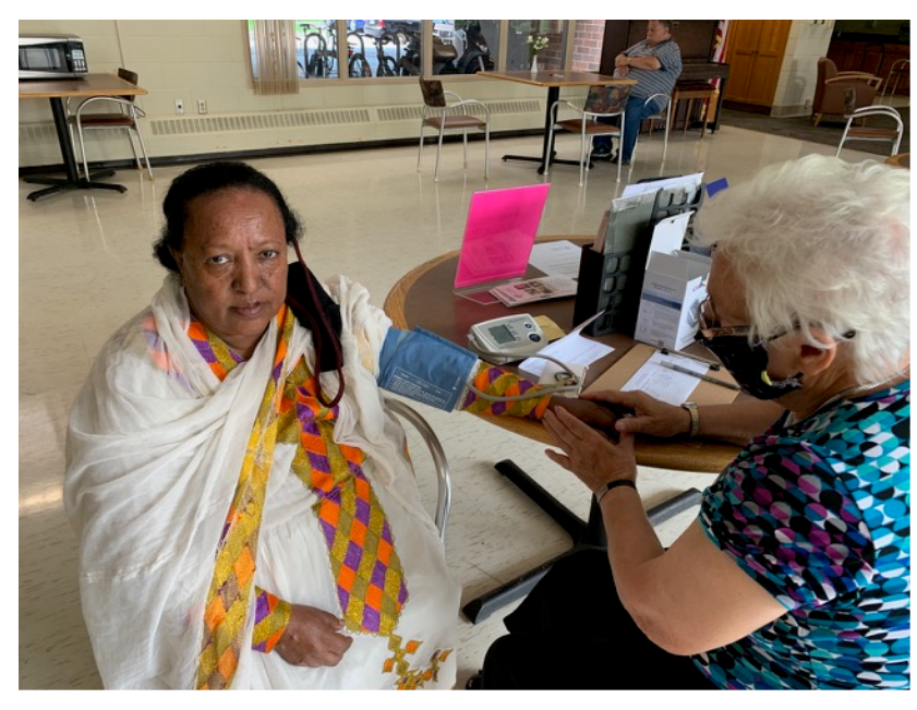
Saint Anthony Park Area Seniors