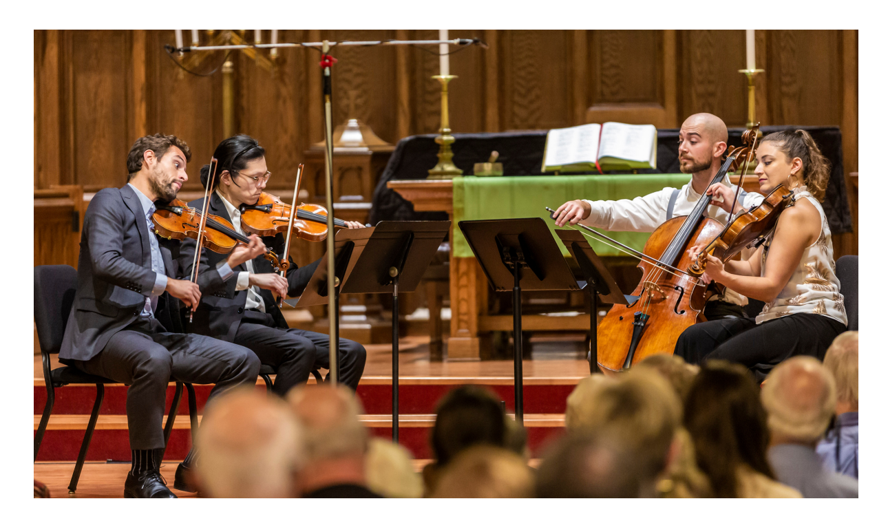
The Schubert Club- The Dover Quartet at the Saint Anthony Park United Church of Christ

University of Minnesota Raport Center Murray School Partnership-a program to create awareness of and student engagement in environmental studies.