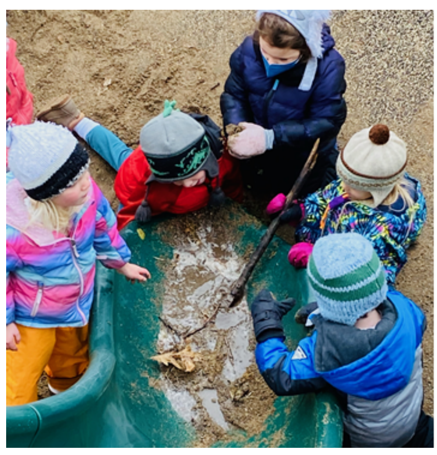
Saint Anthony Park Co-op Preschool