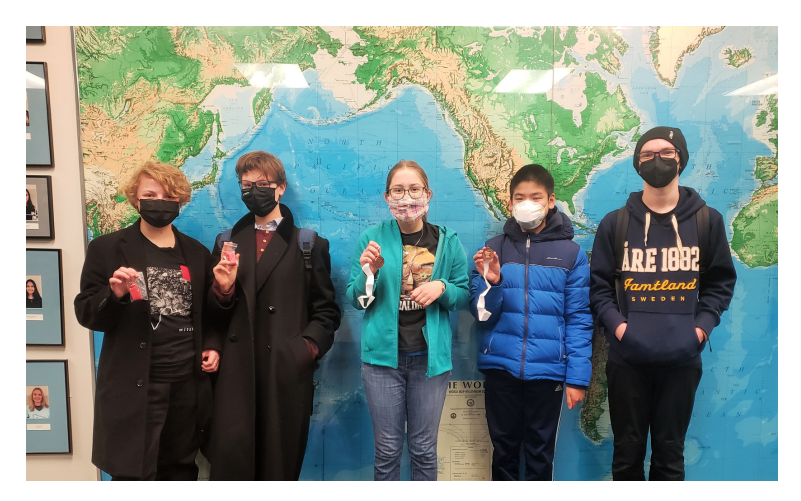
Urban Debate League