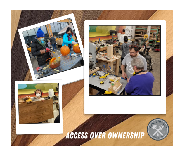
Minnesota Tool Library