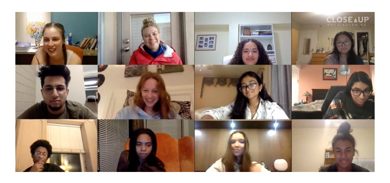
Close Up Foundation Virtual Session

Langford Park Hockey-Girls' Hockey Program