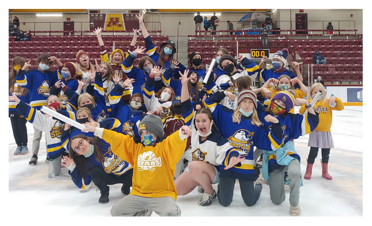
Langford Park Girls Hockey Program

2021 awarded grants reflect our continued commitments to improving the environment, strengthening learning opportunities, enhancing livability and aging-in-place, supporting business vitality, and cultivating appreciation of the arts - all of which make Saint Anthony Park a more resilient and healthy community.